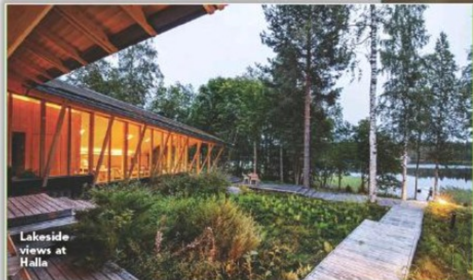
Lakeside views at Halla

For a traditional meal, we recommend Cafe-Restaurant & Hotel Saima. We enjoyed salmon soup followed by a choice of desserts. Lusikkaleivät, a delicate jam-filled biscuit, was our favourite.