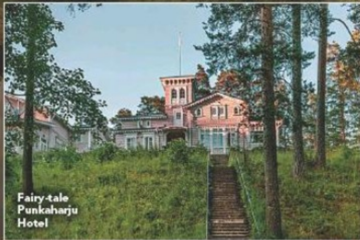
Fairy-tale Punkaharju Hotel