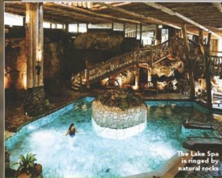
The Lake Spa is ringed by natural rocks

For a luxury adults-only escape, try the serene Kuru Private resort. Here we enjoyed a delicious lunch celebrating flavours of the forest – a mushroom risotto made with spruce needles, salted cranberries and Parmesan, followed by a refreshing spruce shoot ice cream, pear mousse and crystallised white chocolate. We ended our visit with a relaxing sound bath.